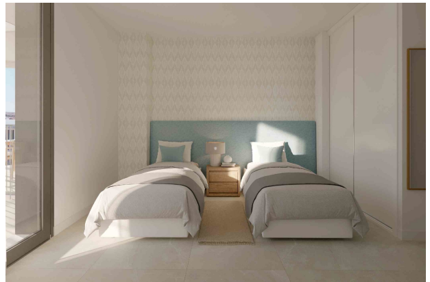
Bedroom 2 (Rendering)