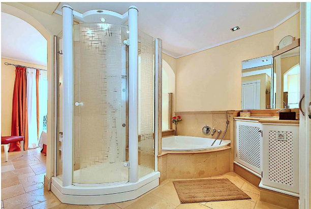
Bath en Suite