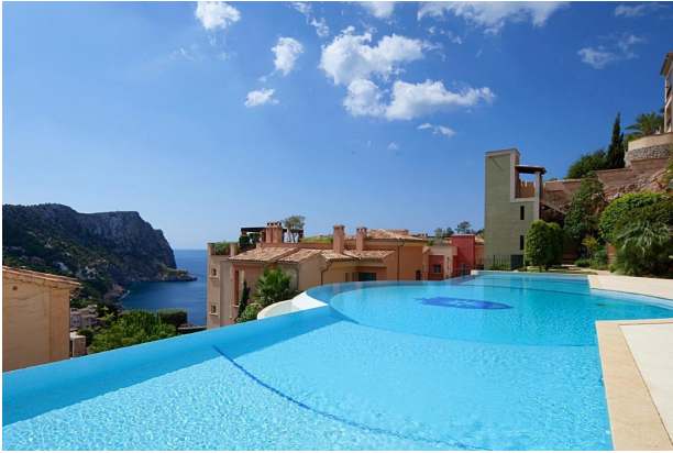
Swimmingpool C (Community))