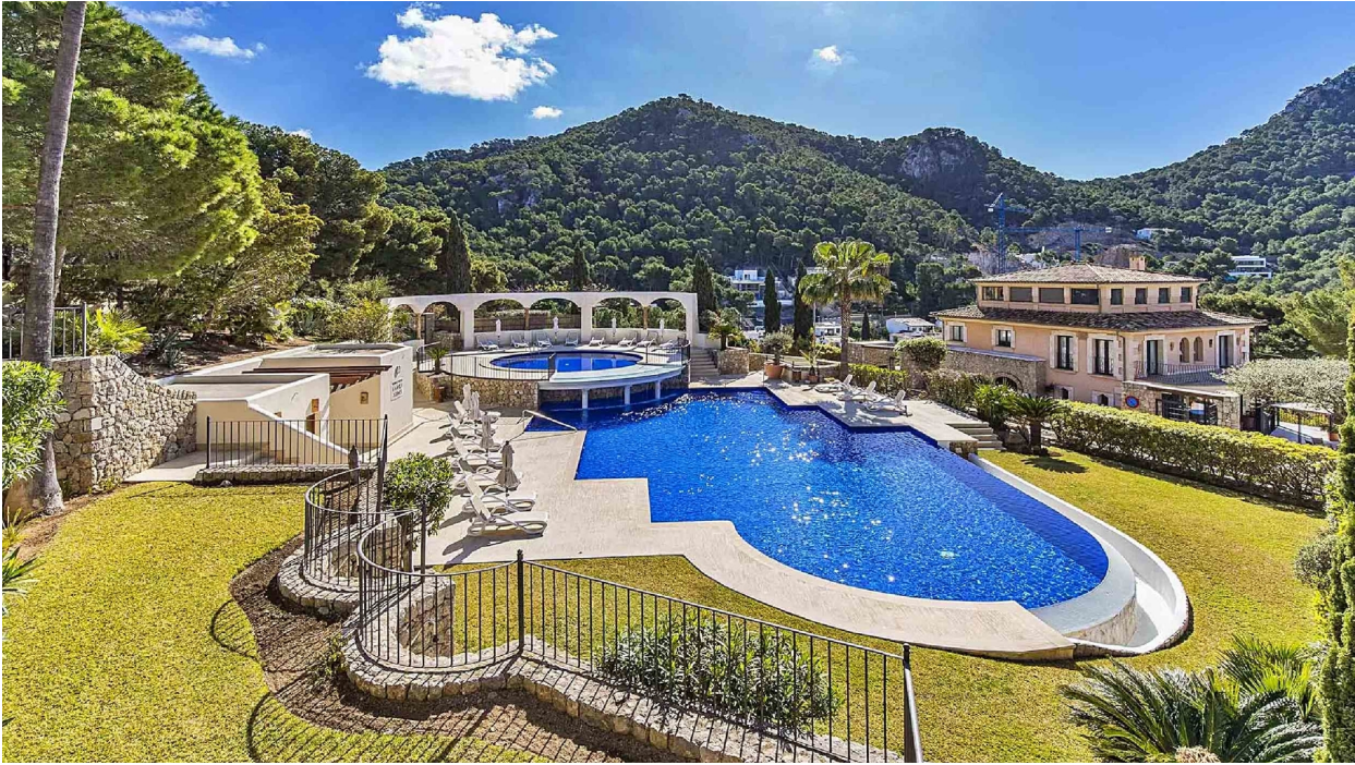
Swimmingpool A (Community))