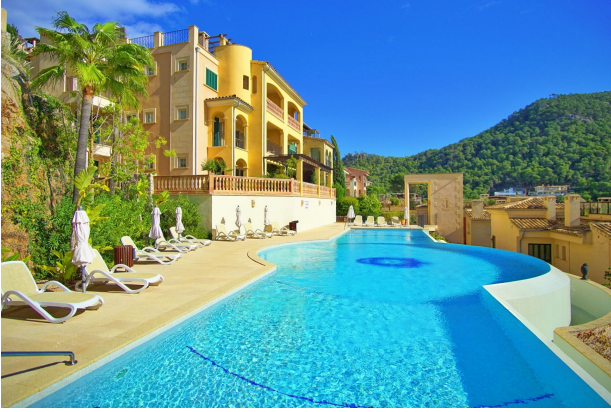
Swimmingpool C (Community))