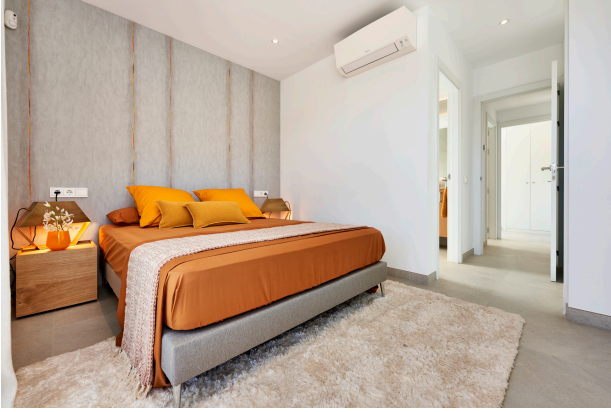
Bedroom (Show flat)