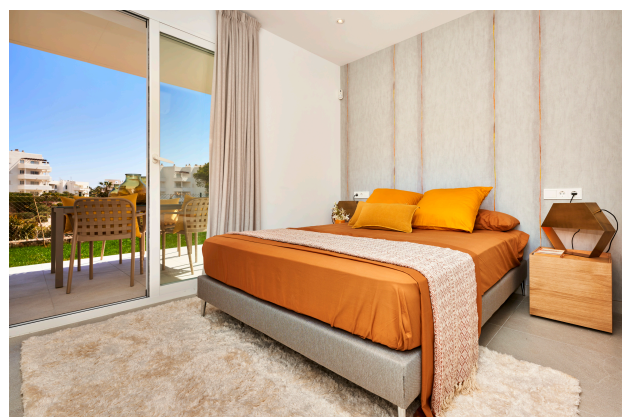
Bedroom (Show flat)