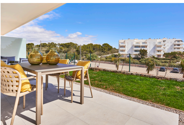
View (Show flat)