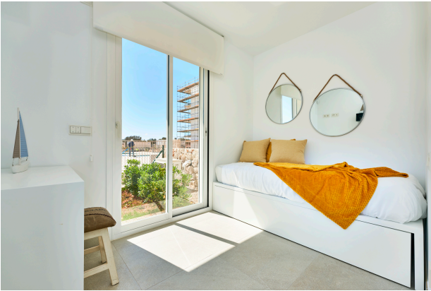
Bedroom (Show flat)