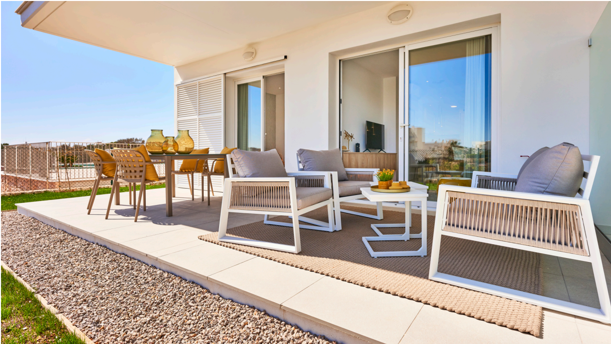
Terrace (Show flat)