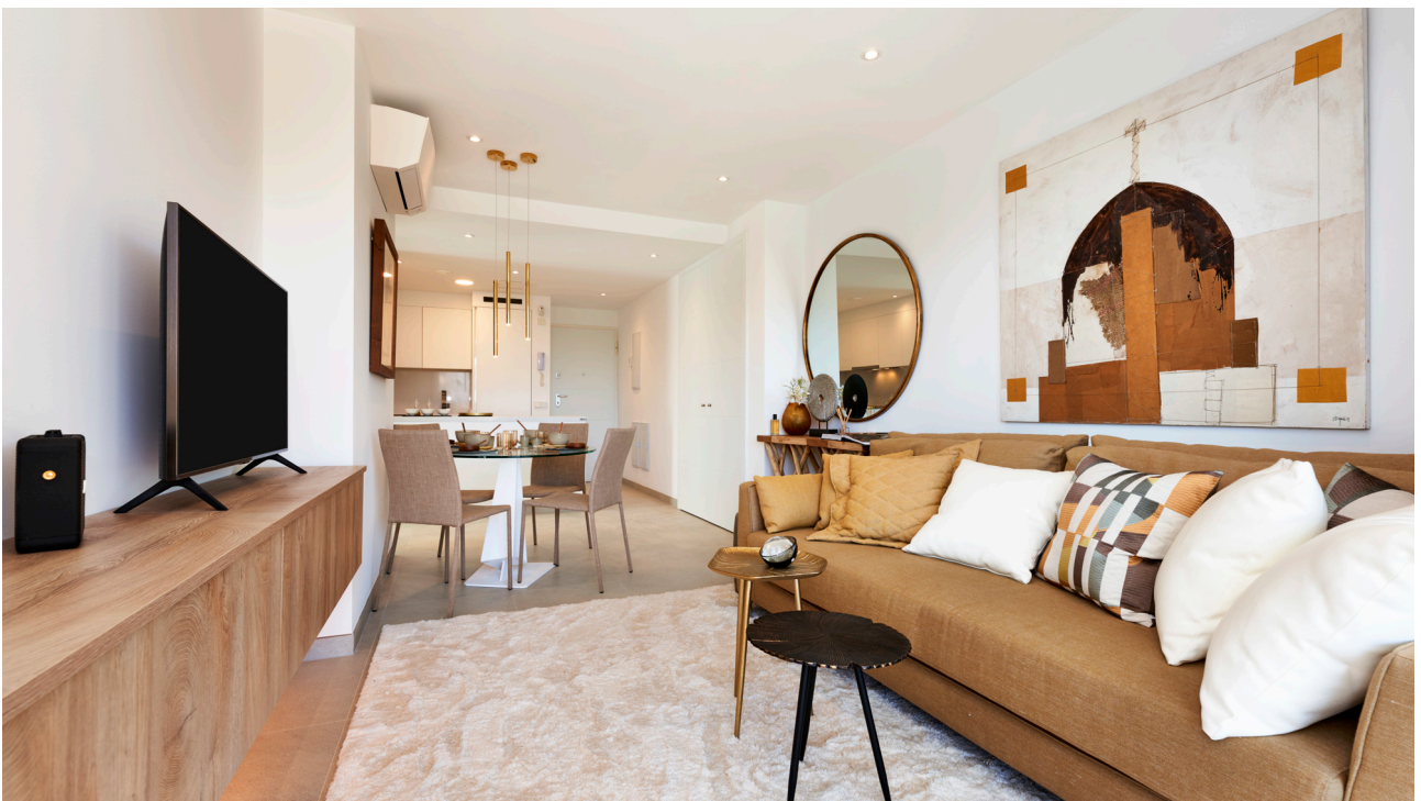
Living (Show flat)