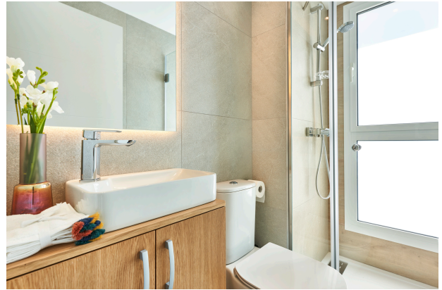
Bath (Show flat)