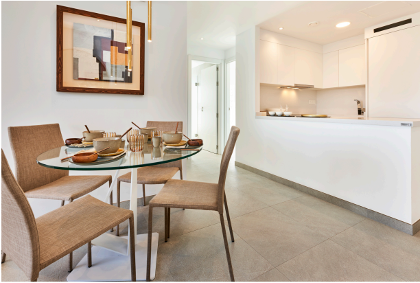
Kitchen (Show flat)