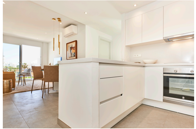
Kitchen (Show flat)