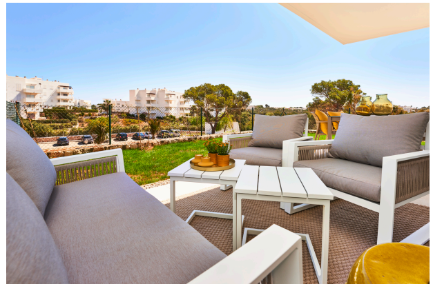
Terrace (Show flat)