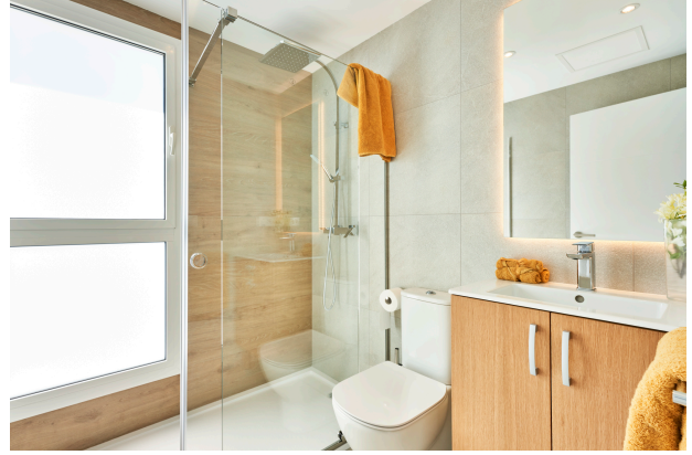
Bath (Show flat)