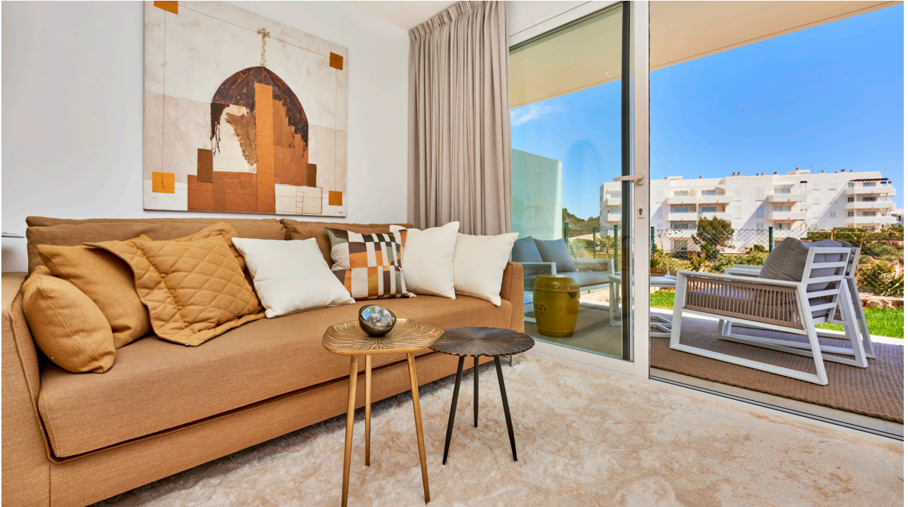
Living (Show flat)