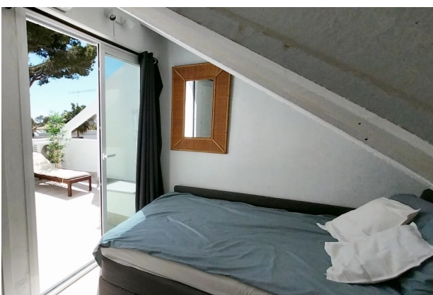
Schlafzimmer 4 (2.OG)