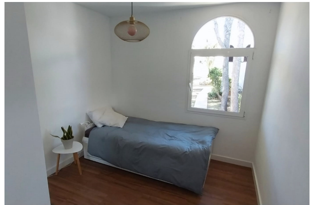
Schlafzimmer 2 (1.OG)