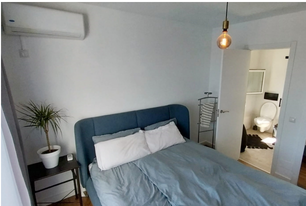
Schlafzimmer 1 (1.OG)