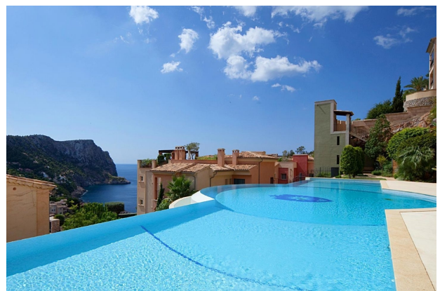
Swimmingpool C (Community)