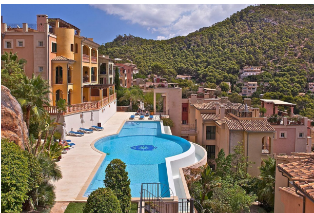
Swimmingpool C (Community)