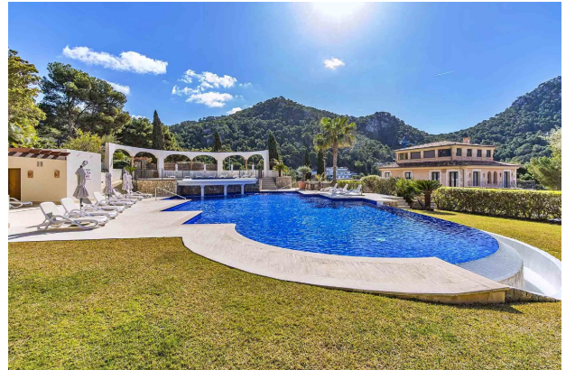
Swimmingpool A (Community)