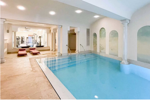
Swimmingpool B indoor (Community)