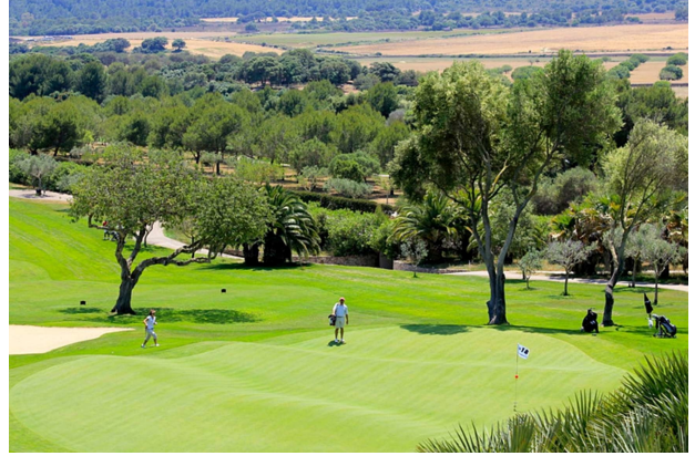
Golf Course (Surrounding)