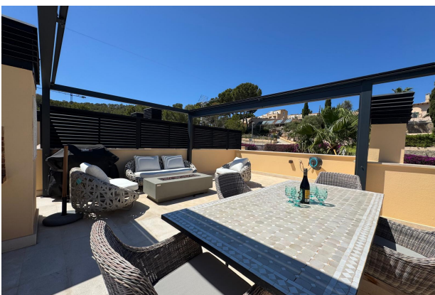
Roof terrace (private)