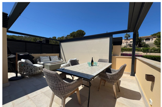
Roof terrace (private)