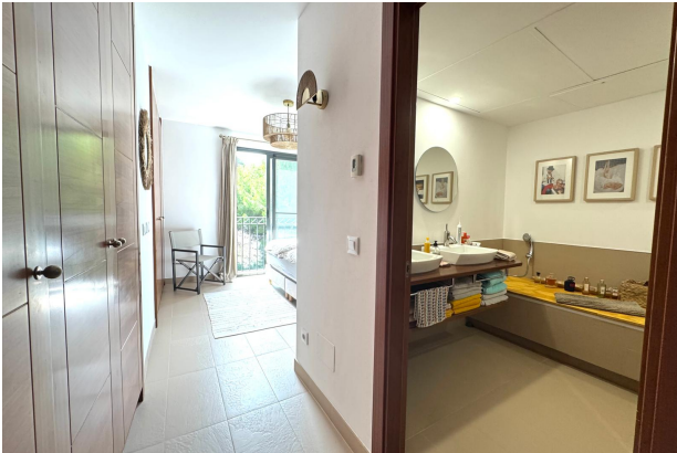
Bath en Suite