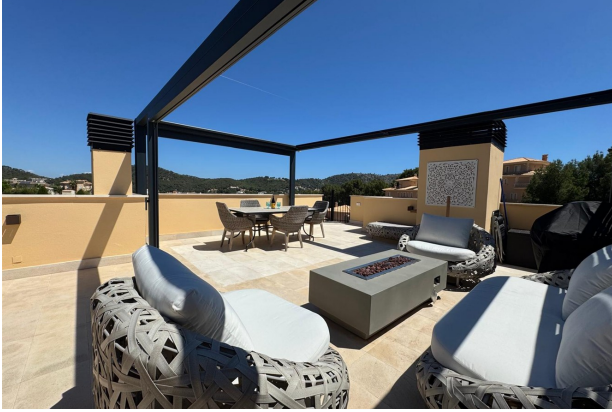
Roof terrace (private)