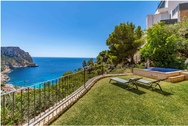
Private garden / Sea view