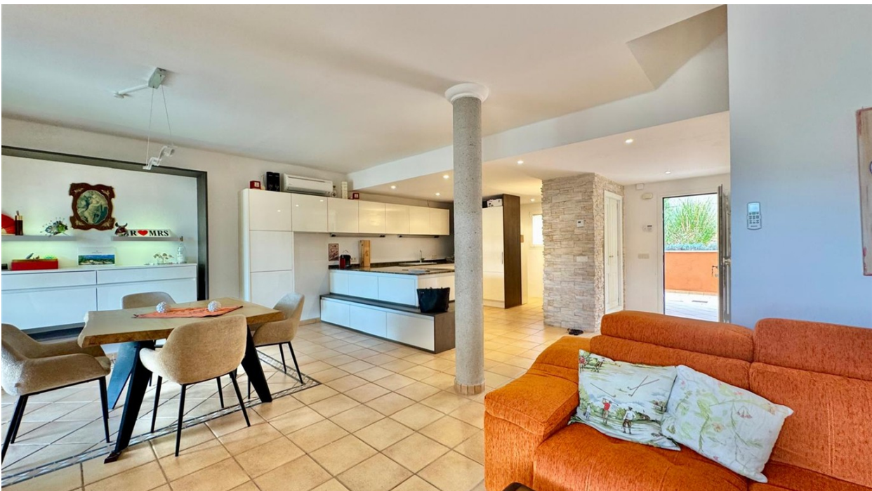
Living / Dining