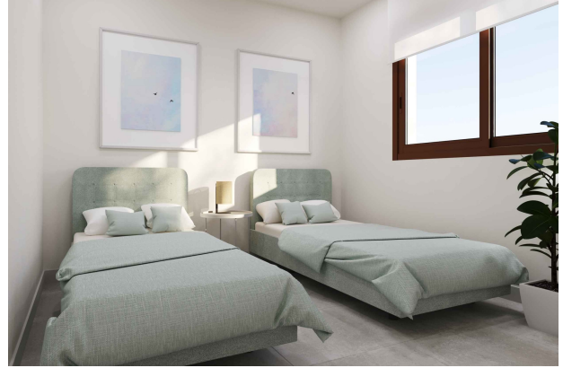
Schlafzimmer 2 (Rendering)