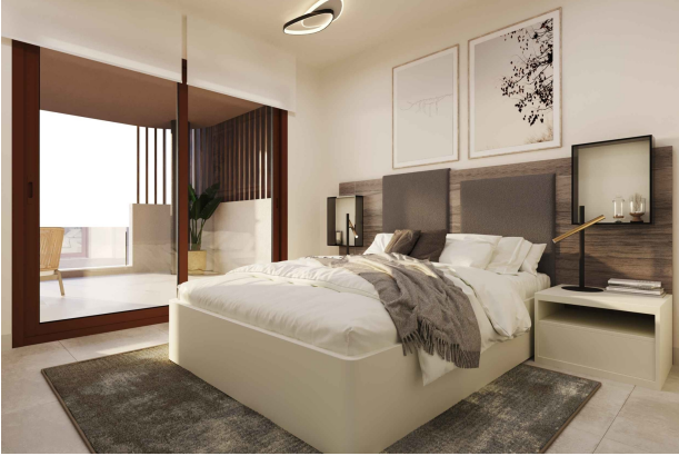
Schlafzimmer 1 (Rendering)