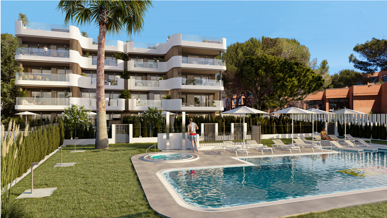
Swimmingpool Gemeinschaft (Rendering)