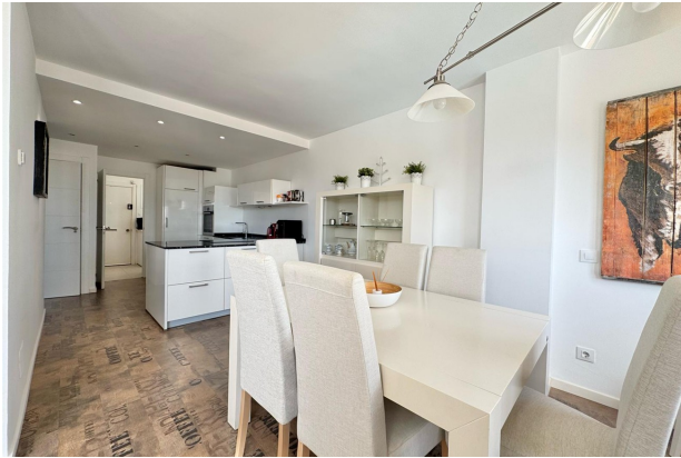
Dining area / Kitchen