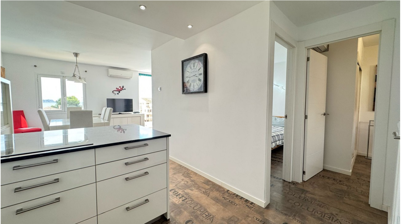
Kitchen / floor