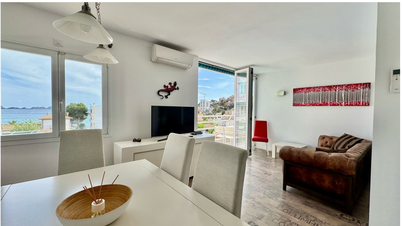
Dining area / Living room